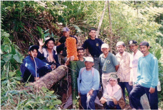
Figure 1. Ripe infructescence/fruit were harvested and collected from Kerinci Seblat National Park, Batang Suliti Resort, Solok District, West Sumatera Province, Indonesia