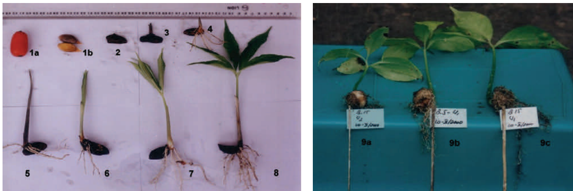
Figure 4. The developmental stages of A. titanum from seeds to seedling (stages 1-9) were shown from the seed germination (stage 2) to first-leaf emergence (stage 8) for 19 weeks and tuber development (stage 9) after 24 weeks); scale is in mm.

growth of a few roots. The leaf-bud height was varied between 20-80 mm after 2 weeks. On 5 th - 8 th week the number of the cataphylls were 5-7; the primary colour of the cataphyll was whitish-light green with dark green to black or reddish to brownish purple irregular blotches. On 5 th week, the seedling (leaf-bud/the highest tip of the most outer cataphyll) was 80-150 mm high and started rooting (a few roots about 3-4 roots) then more rooted on 8 th week. Between 5 th - 8 th week the number of cataphylls were 5-7, whitish light green with dark green to purplish brown blotches (Figure