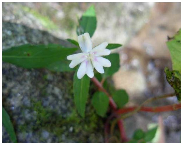
Fig. 1. Habit of Impatiens mamasensis Utami & Wiriad.

Galoeng, 1913, Docters van Leeuwen 528 (BO).