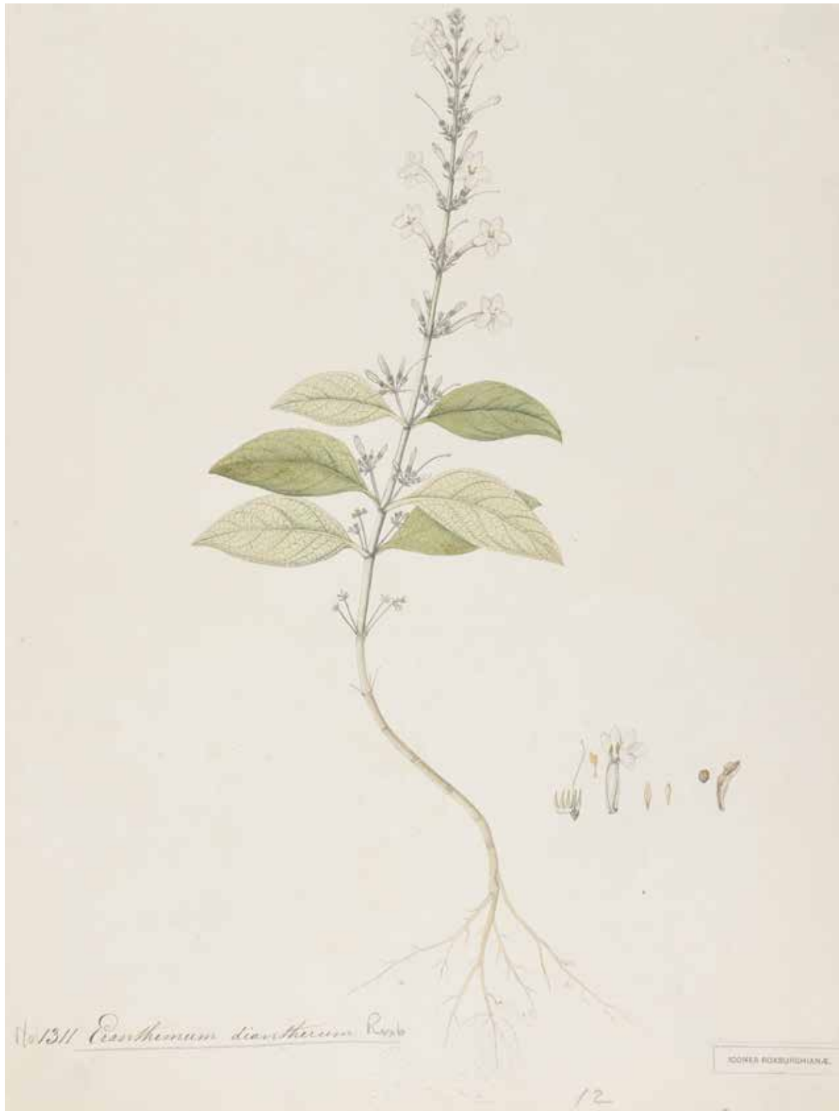
Fig. 1. Photograph of the Roxburgh drawing of Eranthemum diantherum in the collection of the Royal Botanic Gardens Kew.