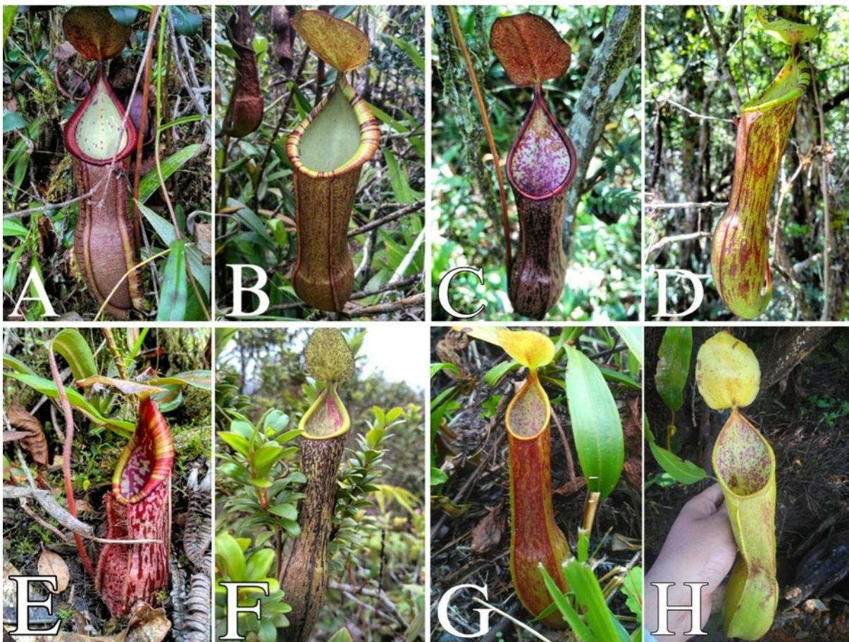
Fig. 5. Putative natural hybrids of Nepenthes that probably only occur in Aceh. A–B. N. lavicola × N. longiptera . A. Lower. B. Upper. C–D. N. lavicola × N. tobaica . C. Lower. D. Upper. E–F. N. lavicola × N. mikei . E. Lower. F. Upper. G–H. N. tobaica × N. longiptera . G. Lower. H. Upper.