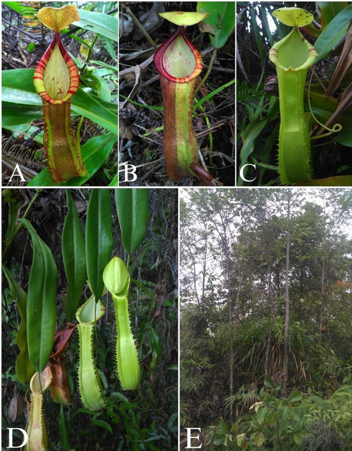
Fig. 4. Nepenthes longiptera Victoriano spec. nov., A. Lower pitcher, mostly bright in colour, ranging from red to orange, or red with speckles. B. Intermediate pitcher, the transition from lower to upper pitcher, usually still retains the colouration of lower pitchers. C. Upper pitcher, with its unique characteristic that still has wings which mostly reduced to ribs in other species, the colour is pure green when mature. D. Vining plant with upper pitcher in locus classicus . E. Typical habitat of N. longiptera in the colony of fern Dicranopteris linearis and small trees.