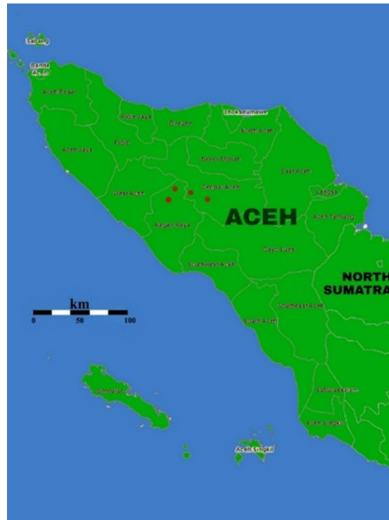
Fig. 2. Distribution of Nepenthes longiptera in Aceh, Indonesia. Red dots: location where the plants are observed and collected.

inflorescence up to 1 m long, with ca. 240 flowers, peduncle 40 cm, bract linear, 2 mm long, partial peduncle two-flowered 4–6 mm long, pedicels 11–15 mm, less than 1 mm in diameter at the base, staminal column 5–6 mm long, anther head 1.5 mm in diameter, tepals elliptic, 4 × 2 mm, green or yellowish and turns into pink at the margin during anthesis. Female inflorescence up to 60 cm long, with ca. 80 flowers, peduncle 36 cm long, bract not prominent, partial peduncle two-flowered 8–12 mm long, less than 1.5 mm diameter at the base, pedicels 3–9 mm, tepals elliptic, 5 × 2 mm, ovary unknown. Fruits valves 4, narrowly linear-elliptic, 34–40 mm long, 4 mm in diameter, bearing 50–90 winged seeds. Seed fusiform with 2 filiform wings 15–20 mm long from tip to tip.