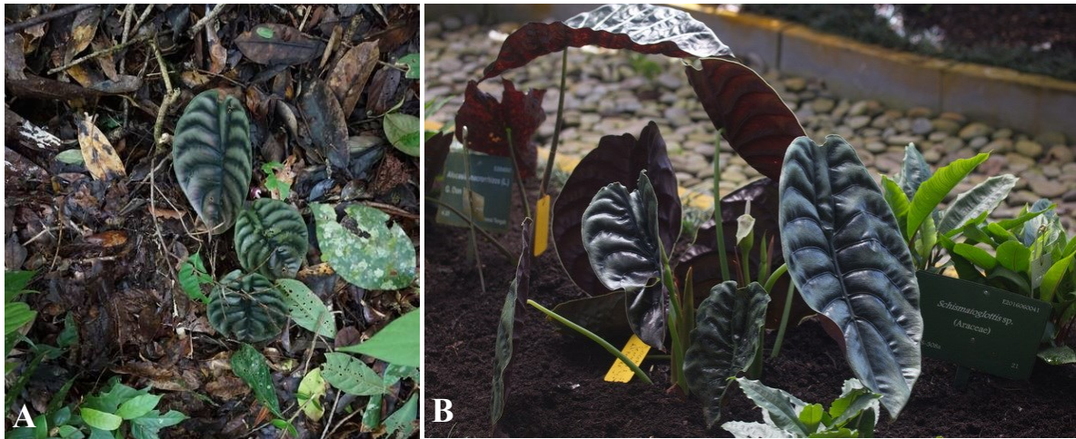
Fig. 2. Habitat of A. cuprea . A. A. cuprea in KMNP. B. A. cuprea cultivated in Bali Botanic Gardens.