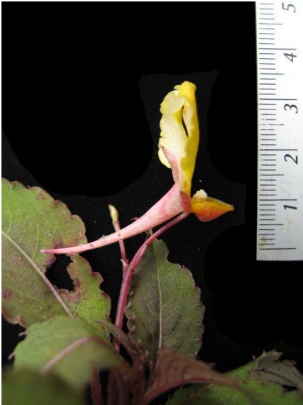
Fig.1. Habit of Impatiens rubricaulis Utami spec. nov.