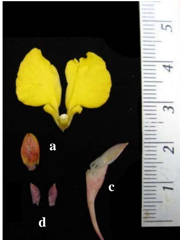
Figs.2. Flora organs of Impatiens rubricaulis Utami a. Lateral united petals, b. Dorsal petal, c. Lower sepal and spur, d. Two lateral sepals