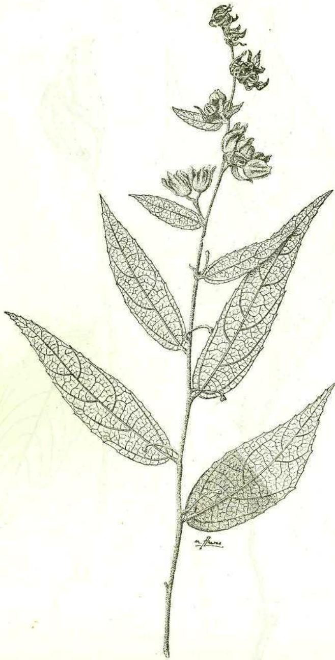
Fig. 4 — Colona grandiflora Kosterm. — Holo-typus