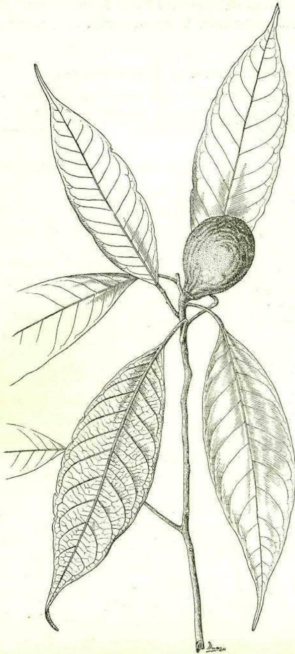
Fig. 2 — Aglaia neotenica Kosterm.; after Hallier 2810 (BO)