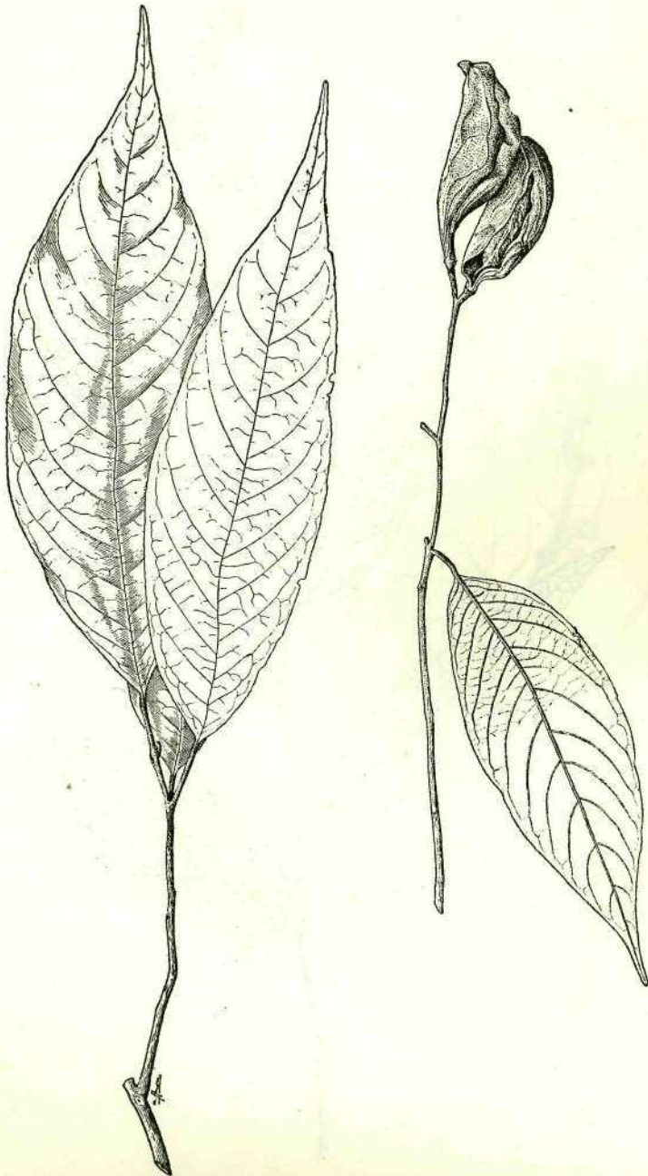
Fig. 3 — Aglaia slercuoides Kosterm. — Holo-typus