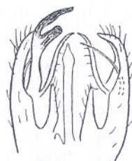
Fig. 2. Gonomyia ( Ptilostena ) punctipennis n. sp. — ♂ hypopygium (large clasper omitted from one side).

somewhat pruinose; pronotum and shoulders ochreous; pleurae dark above, shading to ochreous below. Abdomen dark brown, posterior margins of tergites ochreous. Hypopygium as figured. Legs uniformly ochreous; on the front pair the first tarsal segment is a little over half as long as the tibia. Wings nearly hyaline, veins brownish, costa and R 1 a little lighter. Stigma distinct, dark brown, filling out the end of cell R 1. Small but distinct dark spots at the arculus, the base of Rs and the tip of R 3; Cu 1 a and r-m also somewhat clouded. Sc ending immediately beyond the base of Rs, which is almost angled; R 2 ending only slightly beyond the tip of R 1. Halteres dark.