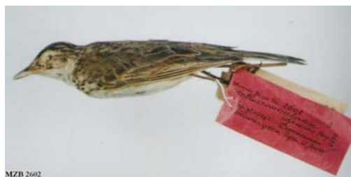
Fig. 2. Anthus novaesealandiae idjenensis Hoogerwerf, 1962 (Lectotype)