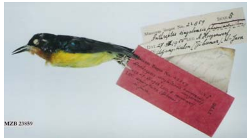
Fig. 2. Anthreptes singalensis bantenensis Hoogerwerf, 1967 (Holotype)