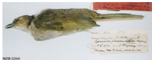
Fig. 4. Pycnonotus plumosus sibergi Hoogerwerf, 1965 (Lectotype)