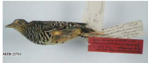
Fig. 1. Turnix suscitator baweanus Hoogerwerf, 1962 (Lectotype)