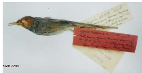
Fig. 3. Orthotomus sepium baweanus Hoogerwerf, 1962 (Lectotype)