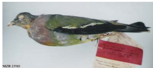
Fig. 2. Treron vernans karimuniensis Hoogerwerf, 1962 (Lectotype)