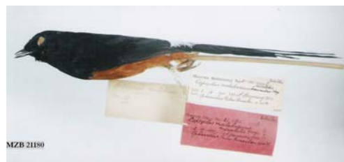
Fig. 2. Copsychus malabaricus mirabilis Hoogerwerf, 1962 (Lectotype)