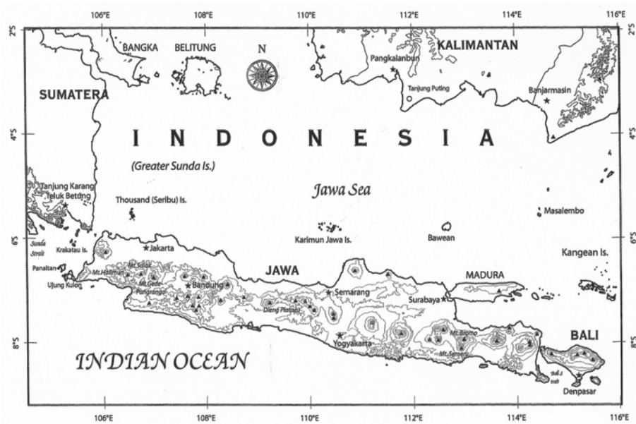
Fig.1. Map of Java and its satellite islands

ed.). Article 73 (b) and the Recommendations following this article of the Code clearly stipulate that «If an author states in the description of a new nominal species should one specimen and only one is “the type” or uses some equivalent expression, that specimen is the holotype». Hoogerwerf had designated two and in one case three “type” specimens for each of the 14 out of his 16 new taxa, instead. It is most likely, Hoogerwerf had the opinion that the types of a taxon must consist of an adult male, an adult female, and in one case a juvenile male - if they are represented in the type series. Only in two of his nine papers that we listed in the references list below, Hoogerwerf (1962a: p. 146 footnote & 1962d: p. 18) mentioned that the types are in Museum Zoologicum Bogoriense (MZB), Bogor, Indonesia and the paratypes are in the Nationaal Natuurhistorisch Museum ( formerly Rijksmuseum van Natuurlijke Historie - RMNH), Leiden, the Netherlands.