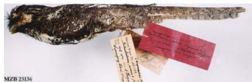
Fig. 4. Batrachostomus javensis longicaudatus Hoogerwerf, 1962 (Holotype)