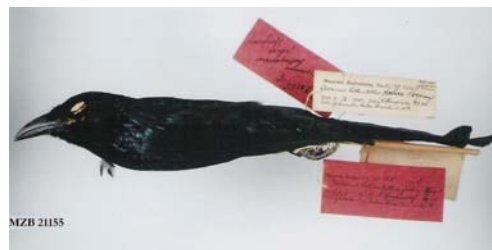
Fig. 4. Dicrurus hottentottus faberi Hoogerwerf, 1962 (Lectotype)