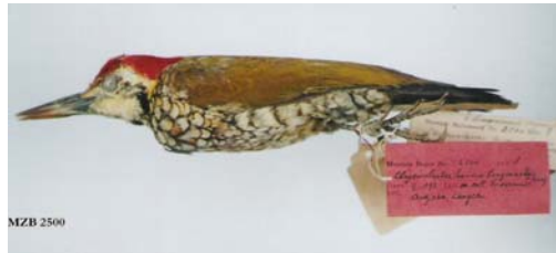
Fig. 1. Chrysocolaptes lucidus kangeanensis Hoogerwerf, 1963 (Lectotype)