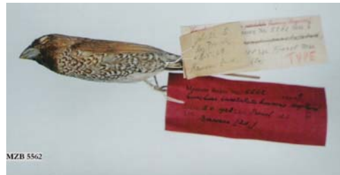
Fig. 3. Lonchura punctulata baweana Hoogerwerf, 1963 (Lectotype)