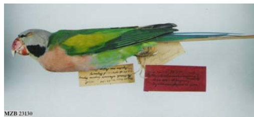
Fig. 3. Psittacula alexandri kangeanensis Hoogerwerf, 1962 (Lectotype)