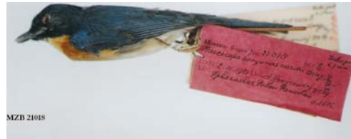
Fig. 1. Niltava banyumas mardii Hoogerwerf, 1962 (Lectotype)