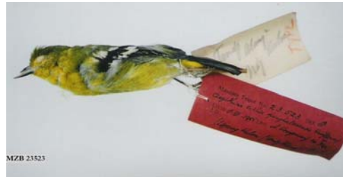
Fig. 1. Aegithina tiphia djungkalensis Hoogerwerf, 1962 (Lectotype)