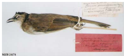
Fig. 3. Pycnonotus goiavier karimuniensis Hoogerwerf, 1963 (Lectotype)