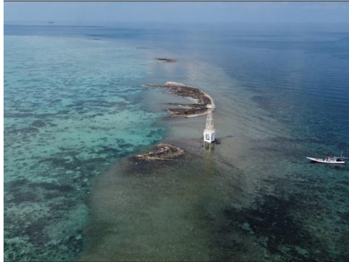
Figure 4. View of Karang Kapal islet, with narrow stretch of coral gravel's stacks, 18 June 2022.

A 3.1 ha island covered by a coastal forest, dominantly by Beach She-oak tree Casuarina equisetifolia (5°50'55.0"S 110°14'23.5"E). There is c.0.725 ha coral gravel stacks around the island and also used by Black-naped Tern to breed.