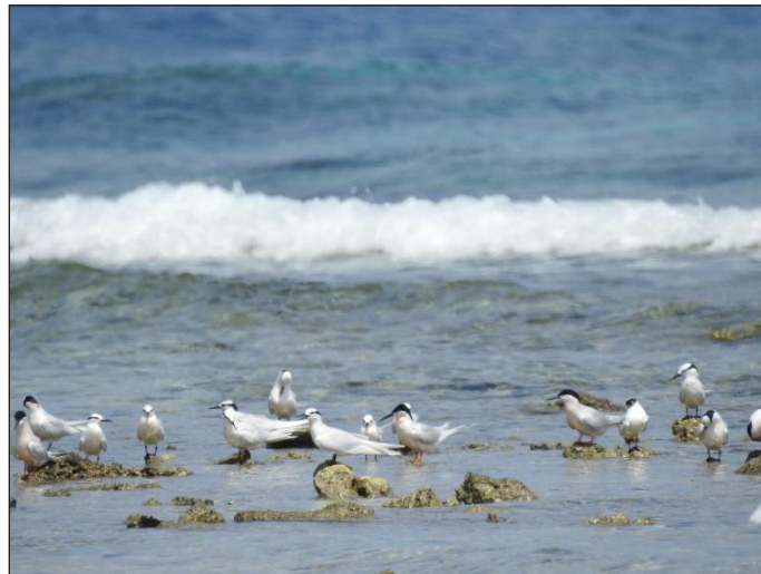
Figure 8. At least three Roseate Terns (showing full black cap, black bill and pinkish tone underparts) in flock with Black-naped Terns in Krakal Besar I., 2 May 2019, which become the earliest record of the species in Karimunjawa Is.

Further observations reveal the species as a regular breeding visitor in Karimunjawa Is. Here we report our findings, collated from field observations and photo inspection to describe its breeding and conservation. The Roseate Tern only occurs in Karimunjawa Is. during May-August (Table 1), where it comes to the islands for breeding. It corresponds with the earlier records on Java, Obi Is., Ree I., Tayandu Is., Maluku (Hartert, 1901) and Pulau Yu and Tokong Burung, Peninsular Malaysia (Gibson-hill, 1950). Our findings added previous available information for Java, where breeding was recorded in April and May (Hoogerwerf, 1949a; Hellebrekers & Hoogerwerf, 1967).