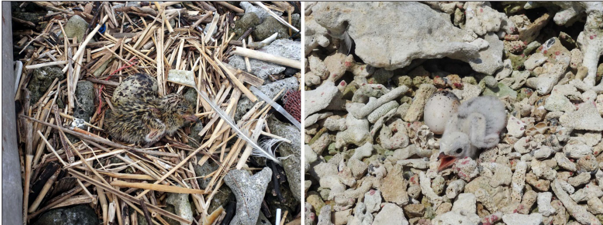
Figures 9 (left) & 10 (right). Nest of Roseate Tern containing a single egg and chick constructed of dried twigs found in Krakal Besar I. on 21 May 2022 (left). A clutch containing a single egg and chick of Black-naped Tern in Karang Kapal islet, 24 August 2019, for comparison (right).

The chick is a combination of dark brown and black pattern. It differs and can be easily distinguished with the chick of Black-naped Tern that is dominantly white with blackish in appearance (see Fig. 9-10). The two can be seen in the same location (Fig. 11).