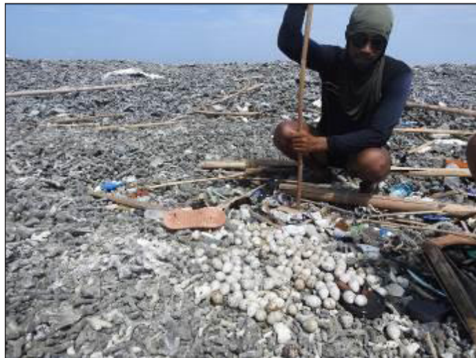
Figure 12. A Karimunjawa National Park staff counting the abandoned eggs found during sea patrol, 18 June 2020.