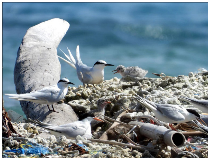
Figure 11. A chick of Roseate Tern showing a dark brown appearance (below) in group with two whitish chicks of Black-naped Tern, 20 July 2022.