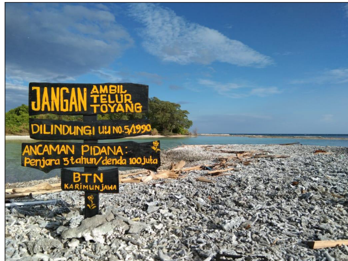
Figure 13. One of the sign boards inscribed “Do not take any egg’s tern” was placed in Krakal Besar I. 13 August 2020. Photographed by Hary Susanto.

Potential threat might also come from sea-level rise as one of the climate change effects, and by the end of 21st century, the sea level predicted to rise 1-2 meter, thus inundated tropical atolls and other low-lying islands as the seabird nesting habitat (Hatfield et al., 2012; Phillips et al., 2022). This situation might wipe out all of the low-lying coral islets in Karimunjawa Is. used by Roseate Tern to breed as it is only less than 1 meter high from the water surface.