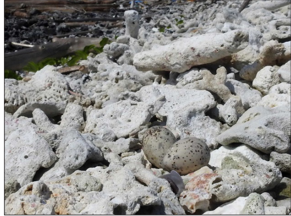
Figures 6 (left) & 7 (right). A close inspection found the nest of Roseate Tern to contain a single egg, Karang Ketel, 24 May 2021 (left). Two eggs of Black-naped Tern found in the same area and day (right).