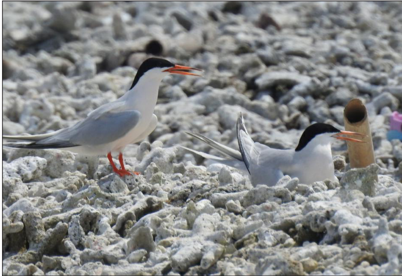
Figure 5. A pair of Roseate Tern at nest, Karang Ketel, 24 May 2021.

The egg seems to be just laid on the surface of the coral gravels, without any material or decoration (Fig. 6). It is shown as an oval shape, light brown or tan color appearance, marked with dark and bold patches. It differs from (Hellebrekers & Hoogerwerf, 1967) that describe it as “greyish with dark brown spots, smears and underlying shell-marks” and asserted to be very similar to the Black-naped Tern S. sumatrana . However, in our observations, we found the egg can be distinguished from the more common Black-naped Tern, especially by its colour and marks pattern, where the latter have a whitish appearance covered by small dots (Fig. 7). Variation in the Roseate Tern’s egg appearance may occur as evidently shown in the two egg specimens from Java (see Fig. 1 & 2), even if it came from one clutch as shown in Wuyu Islet (Hu et al., 2013).