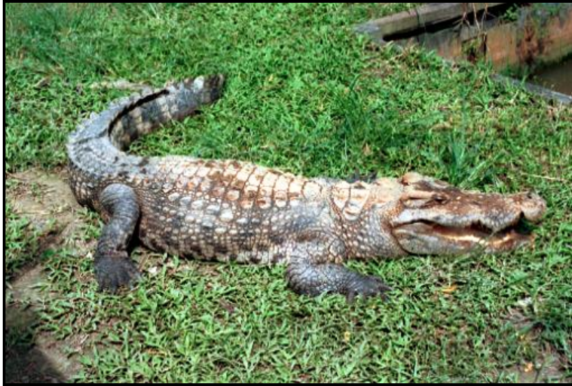
Figure 2. Pure Crocodylus siamensis at CV Surya Raya Crocodile Farm in Balikpapan, East Kalimantan.

He recalled that the villages were around Jempang Lake, where most of the collectors stay. The owner initially thought that all of his crocodiles were C. porosus , and had placed all of them ( C. porosus and C. siamensis ) together in a semi-natural captivity. The two species of crocodiles grew and bred in this breeding pond for about 10 years.