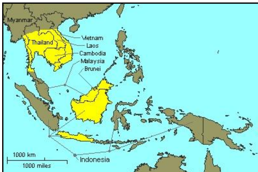
Figure 1. Distribution map of Crocodylus siamensis (yellow color) (Source: www.flmnh.ufl.edu ).

In April 2005, the CSG Chairman, met with Government of Indonesia and crocodile industry in Jakarta. All participants agreed that it was important for Indonesian scientists to become more involved with C. siamensis (and T. schlegelii ) conservation efforts in Indonesia, in partnership with the local crocodile industry. As a result of this meeting, this survey was planned and undertaken as a first step towards the development of a future systematic survey program and conservation and management plan.