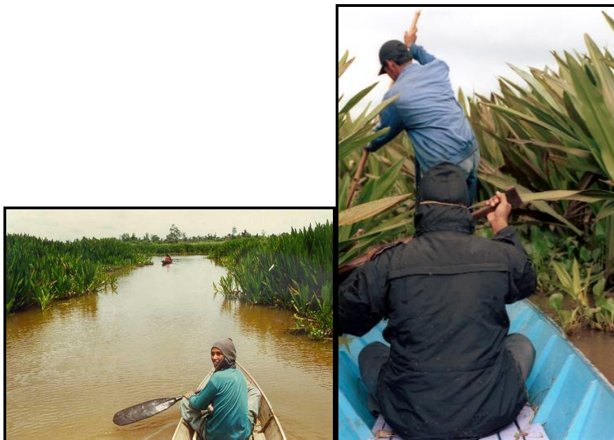
Figure 5. Comparison area of Tanah Liat Lake in 1995 (left) vs. 2005 (right), where the area had been covered densely with H. malayana and E. crassipes .