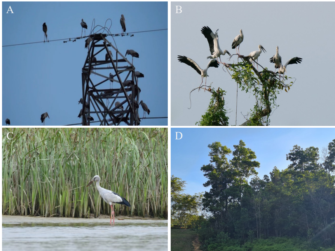
Figure 1. Records of Asian Openbill Anastomus oscitans in Sumatra, Indonesia: A , roosting site on high voltage transmission tower at Teratak Buluh Village (TA); B , flock on the tree about 200m to a roosting site at Teratak Buluh Village, 16 May 2020 (TA); C , an adult Asian Openbill at Kampar River, 18 February 2020 (PG); D , The habitat passed by Asian Openbill when in Pelalawan (PG).

around 38 individuals were observed using a high voltage transmission tower as a roosting (Fig. 1A) site while some birds chose a nearby tree instead (Fig. 1B). During bad weather conditions such as storms, the bird was not observed using the tower as its roosting location. Later in August 2020, none of the birds were resighted in this area despite several days of effort.